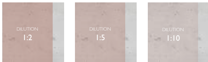
The final color depends on the color of the stain and the color of the support.

ImperGuard® Color Silicate Stain associated with ImperGuard® Color Silicate Thinner can be diluted by default in 3 different levels depending on the desired level of transparency. It is however possible to create a custom opacity by diluting the stain between 1:2 and 1:10.